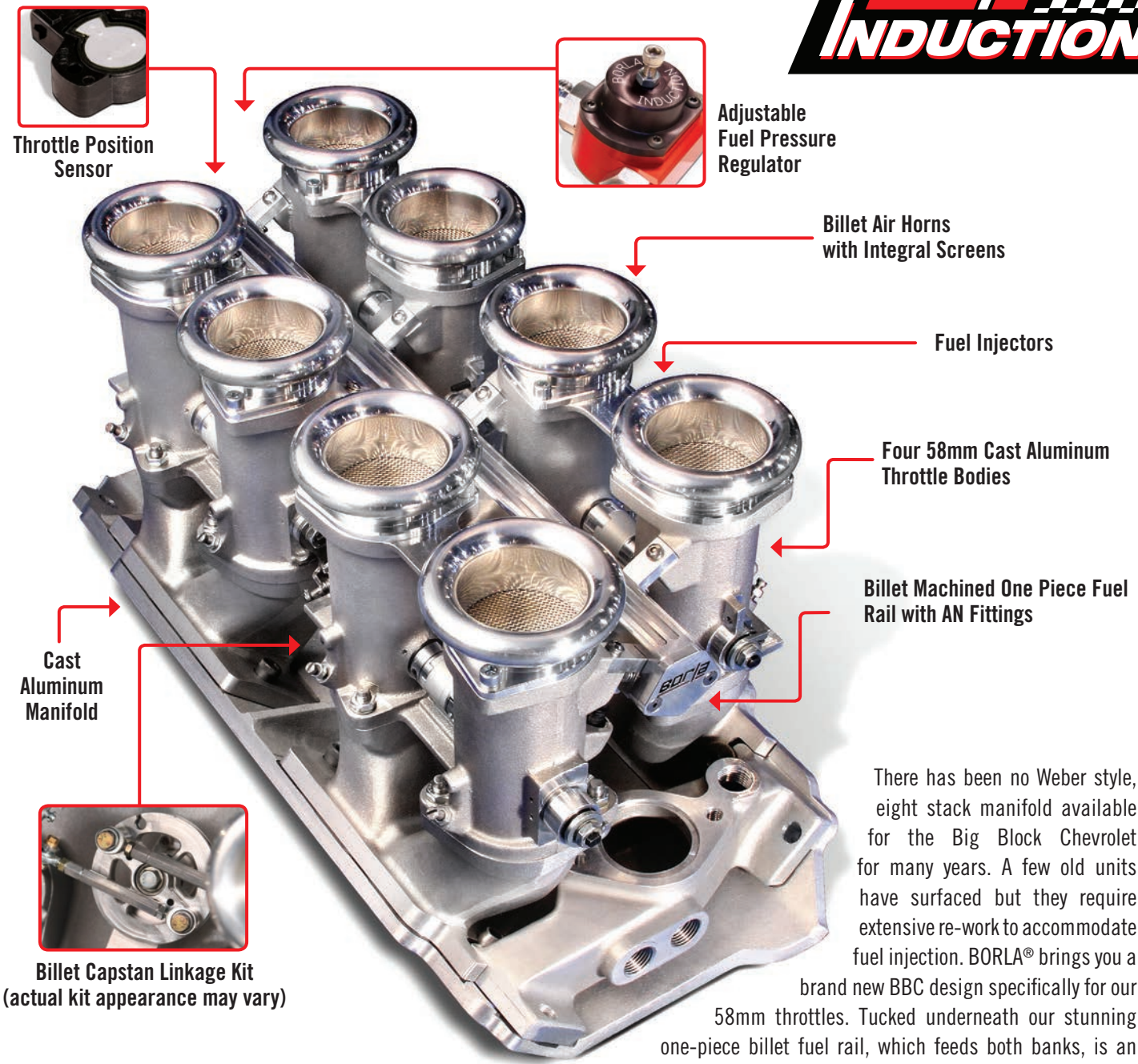
Throttle Position Sensor